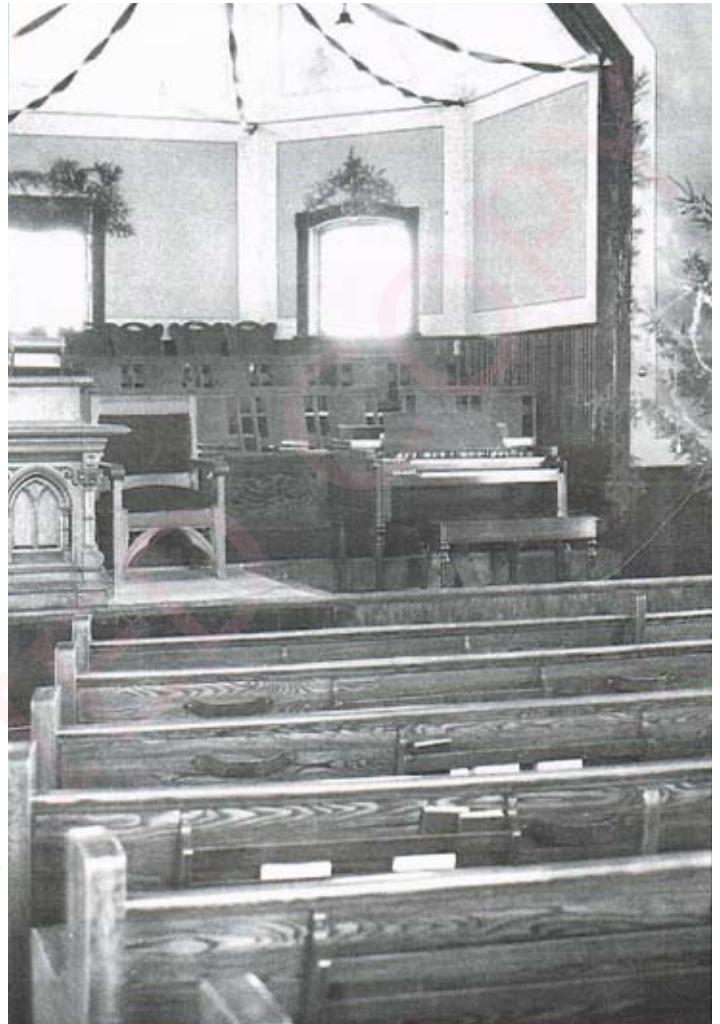
INTERIOR OF ST. ANDREW'S CHURCH, 1940S (MICHENER HOUSE MUSEUM AND ARCHIVES)