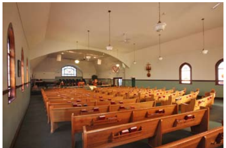
INTERIOR OF SANCTUARY (2012)